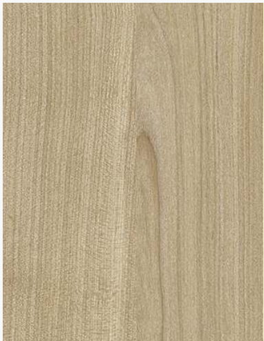
5144 SERBIAN TIMBER