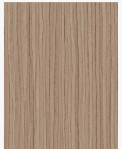
5126 DAKOTA WOOD