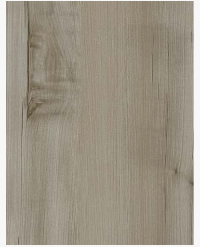
5160 GRIS TRENT