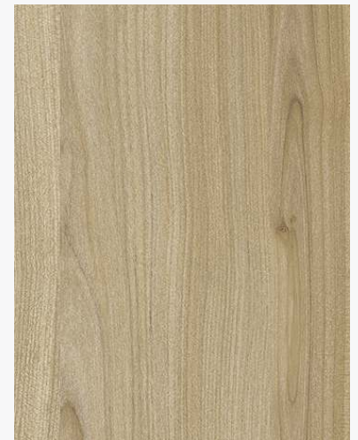
5144 SERBIAN TIMBER