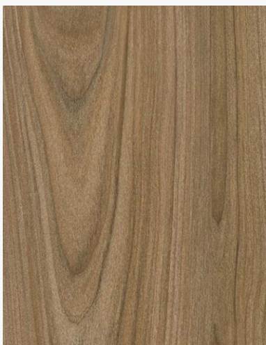
5145 ITALIAN TIMBER