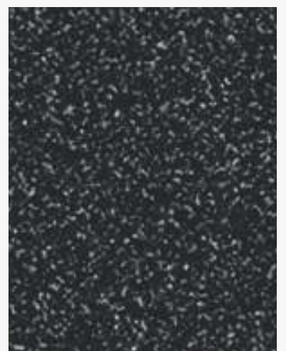
5156 GALAXY BLACK