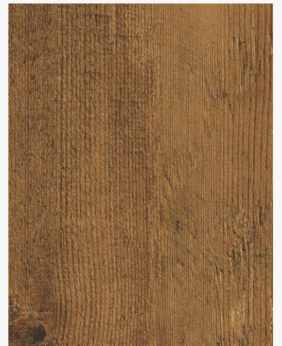
5143 NATURAL MADERA