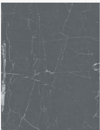
5153 SLATE MARMİ