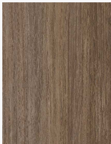
5118 BURMESE LOG