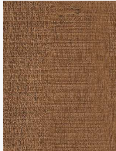
5116 ENRICH MOCHA