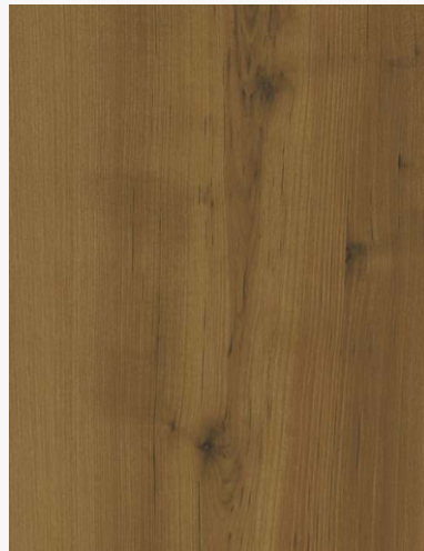
5161 BROWN TRENT