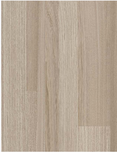
5123 GREEK WOOD