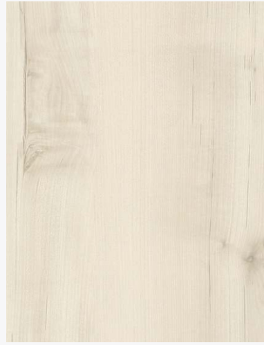
5159 BEIGE TRENT