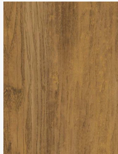
5163 VATICAN NATURA