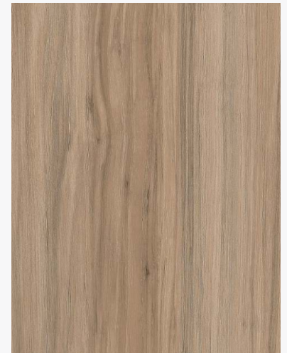
5136 NOVARA KHAKI