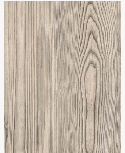
5139 KALAHARI BEIGE