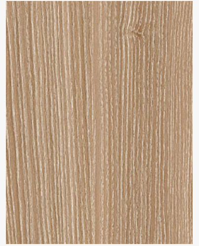
5111 BROWN BARK