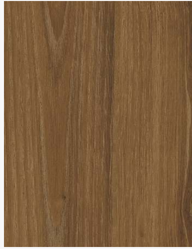
5109 ANTIGUA WOOD