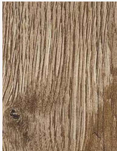
5141 ALPINE DARK