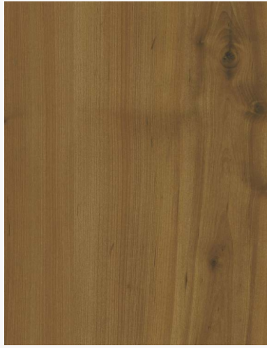
5161 BROWN TRENT