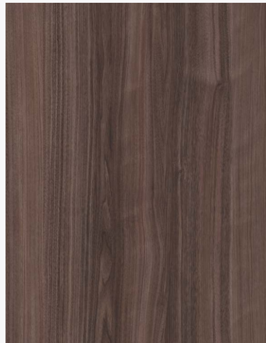
5137 KALAHARI CHOCO