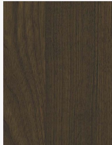
5133 SOLITAIRE HICKORY