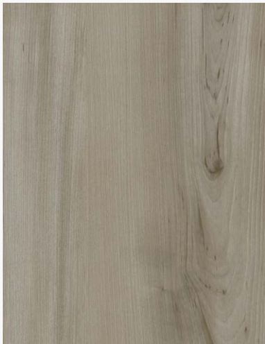
5160 GRIS TRENT