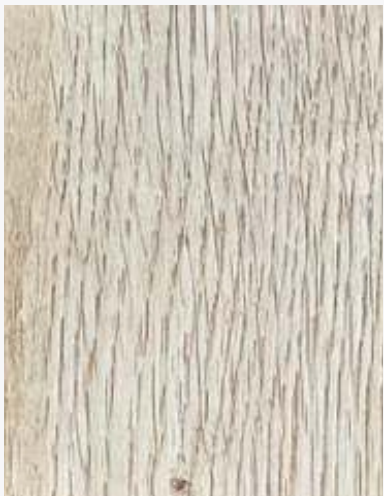
5140 ALPINE LIGHT