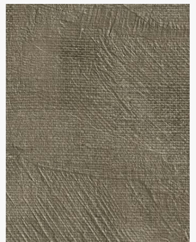
5166 FRANCIS BRONZE