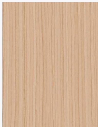
5125 SIENNA WOOD