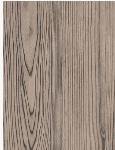
5138 KALAHARI ACACIA