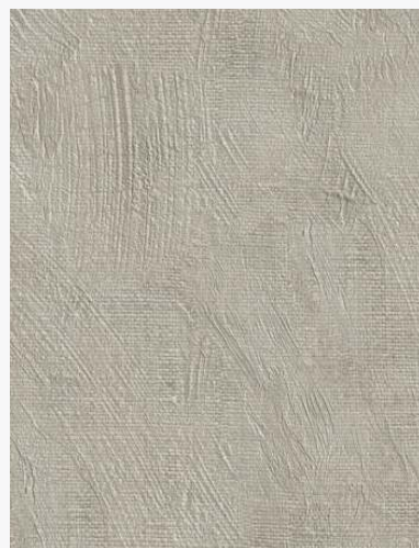
5165 FRANCIS ECRU