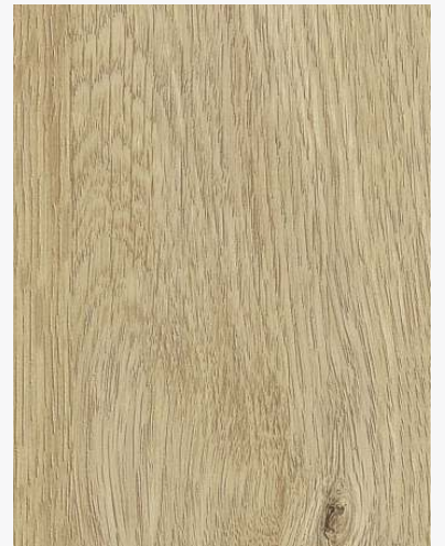
5130 WHEAT SURF