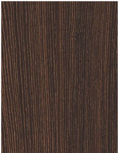
5112 COFFEE BARK