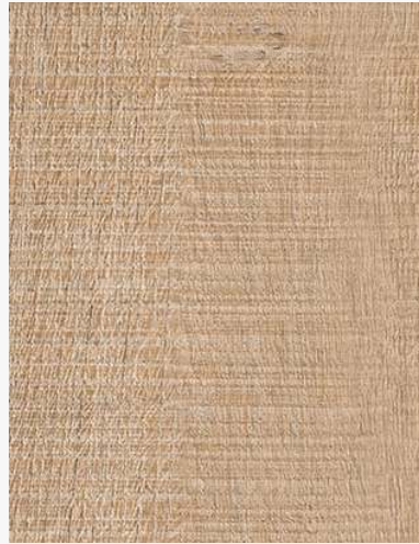
5115 ENRICH NATURA