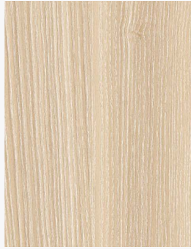
5110 BEIGE BARK