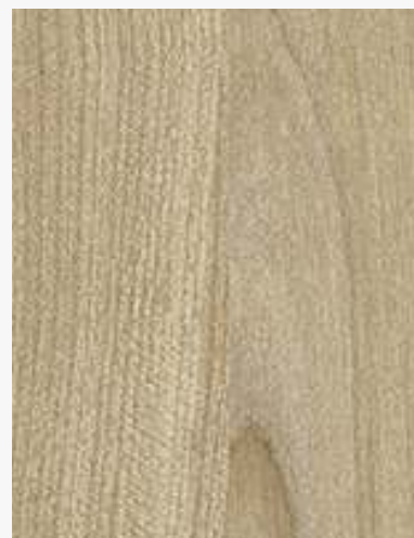
5144 SERBIAN TIMBER