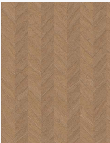
5150 SAND MOUNT