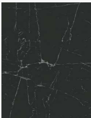
5154 COSMIC MARMİ