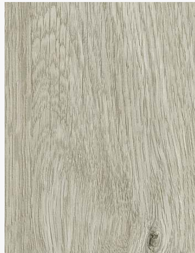
5128 GREY SURF