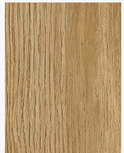
5157 CHILEAN TIMBER