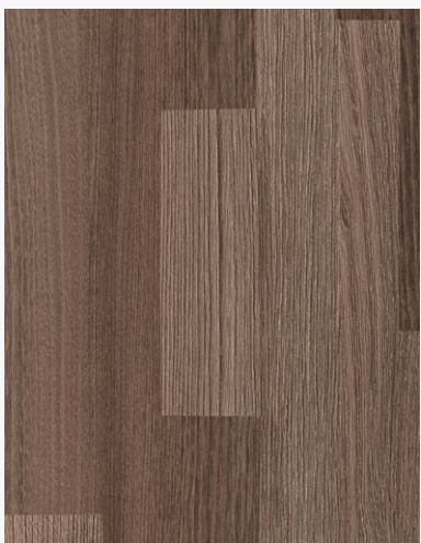
5124 CHOCO WOOD