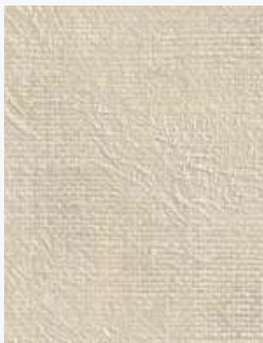
5164 FRANCIS FAWN