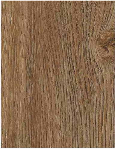
5158 KENYAN TIMBER