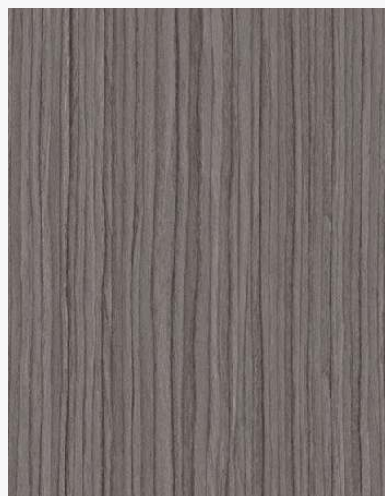
5127 LATTE WOOD