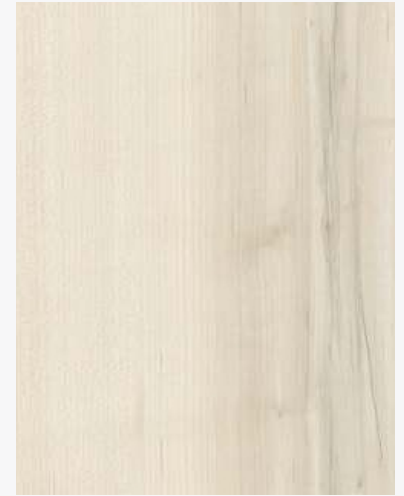
5159 BEIGE TRENT