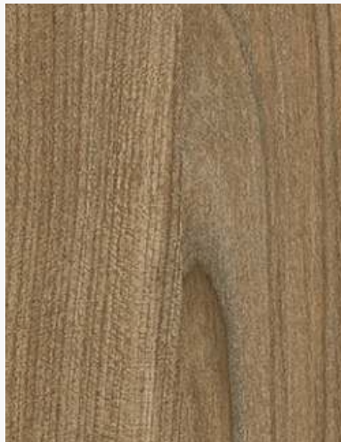
5145 ITALIAN TIMBER