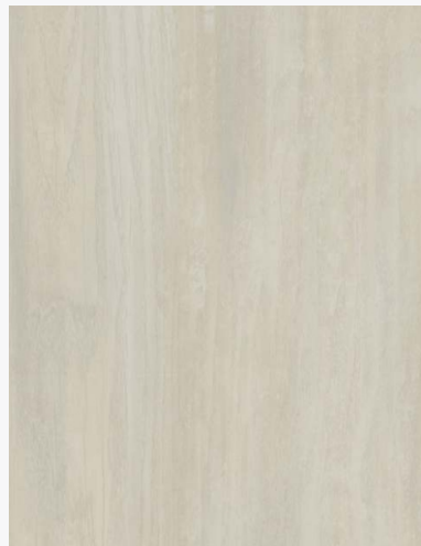
5162 VATICAN ASH