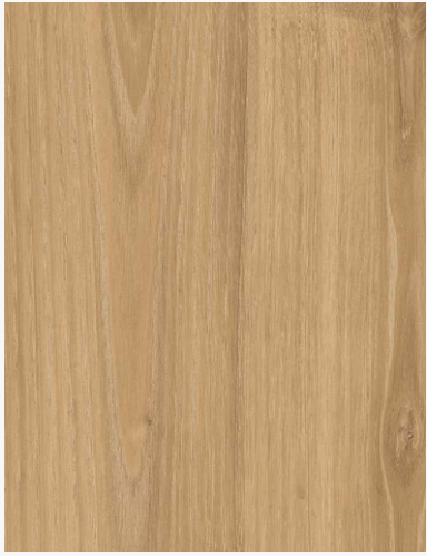
5108 MICHIGAN WOOD