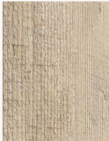
5142 SPRING MADERA