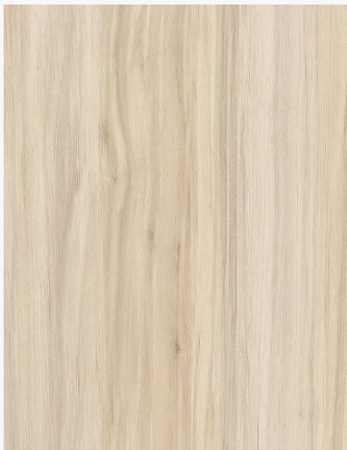
5135 NOVARA CREAM